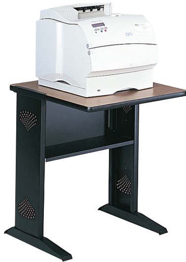
1934 with Mahogany Top Option