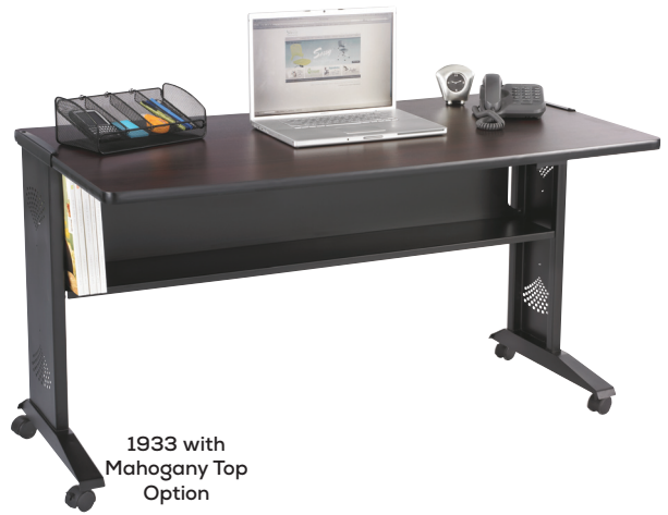
1933 with Mahogany Top Option