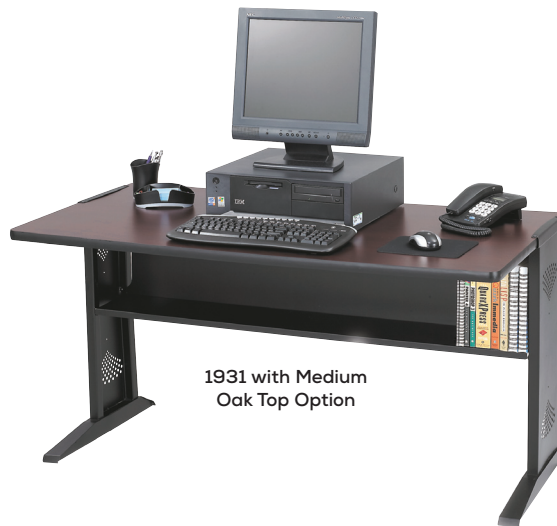
1931 with Medium Oak Top Option