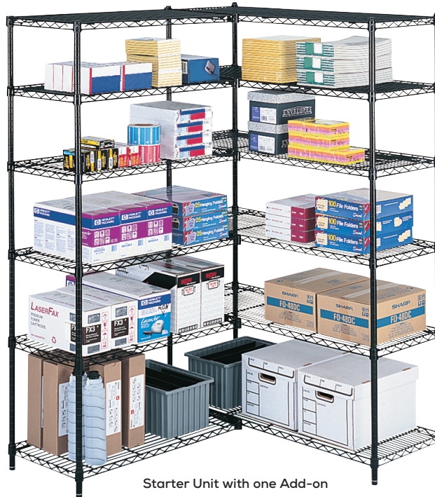
Starter Unit with one Add-on